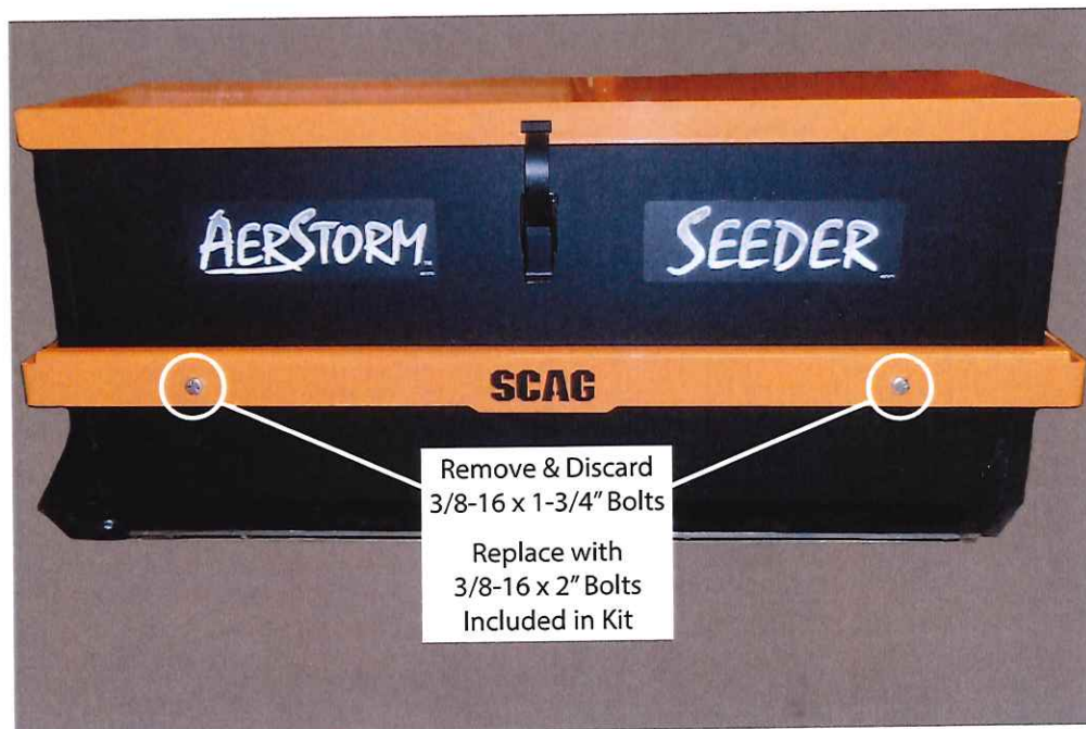
Figure 1. Remove & Replace Hardware